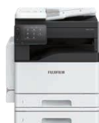
With Tray Module