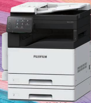
Apeos C2450 S with Optional Tray Module