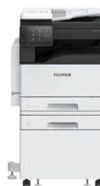
With Tray Module and Cabinet